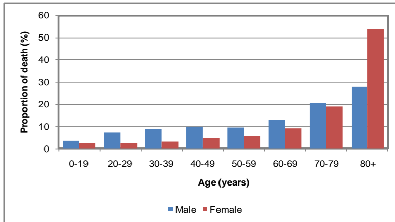
Figure 2b: Proportion of all deaths from external causes (Mentions) by sex, England 2007-2009

Source: ONS Annual Public Health Mortality Extract (2010)